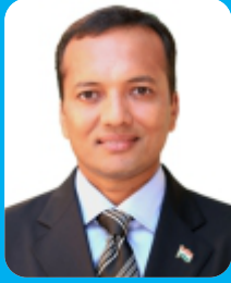
NAVEEN JINDAL CMD, JSPL