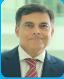
SAJJAN JINDAL CMD, JSW Group