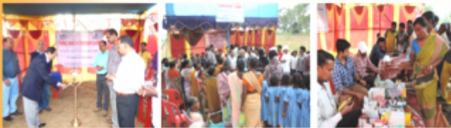
Educating Tribal Children