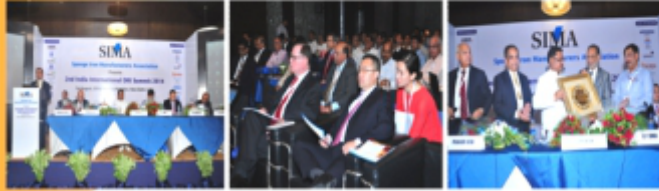
2nd India International DRI Summit, 2014